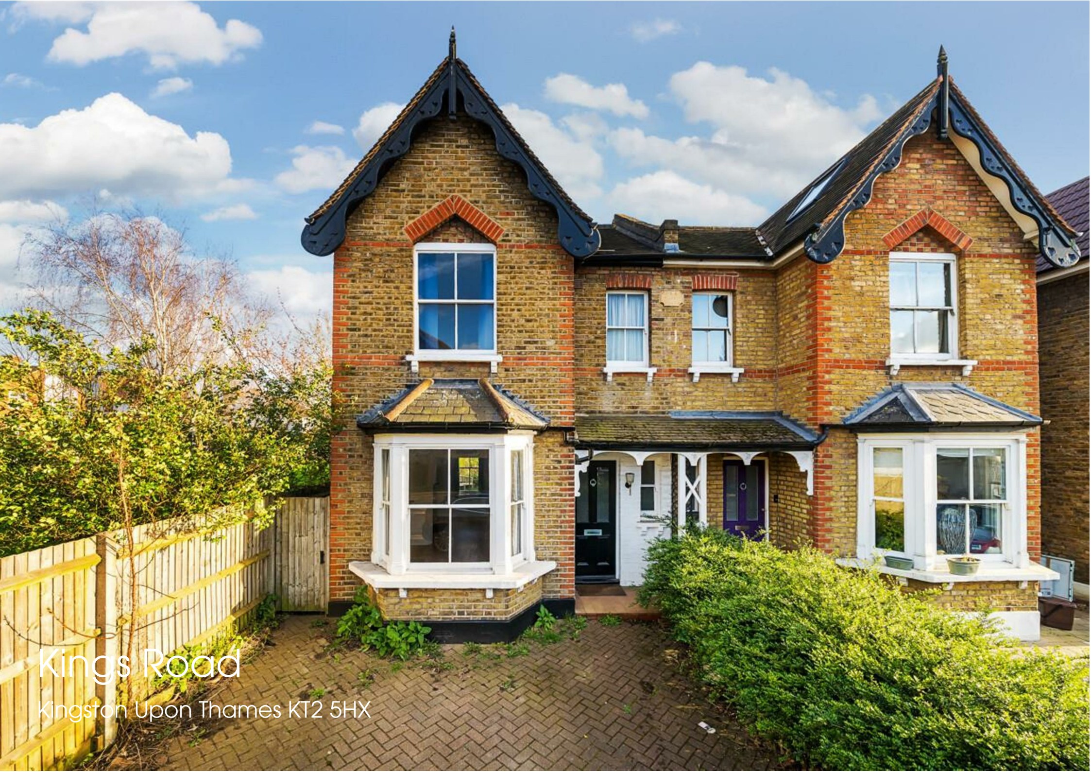
Kings Road Kingston Upon Thames KT2 5HX

34 Richmond Road Kingston upon Thames Surrey KT2 5ED www.gibsonlane.co.uk Tel: 020 8546 5444